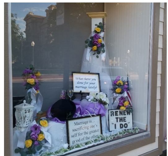
Right photo: one of the many window displays Karen Berning has crafted over the years