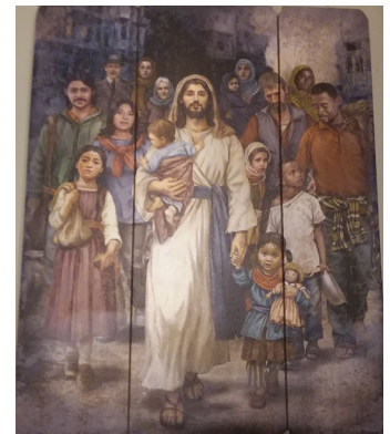
Artwork in the RTL work area reminding staff of our mission of service.

Those who fear and love God can make a difference. You all know the story preceding the Exodus. At the time of Moses’s birth the Egyptian pharaoh had enslaved the Hebrews, “But (scripture tells us) the more they were oppressed, the more they multiplied and spread,” even after the ruler ordered the slaughter of each newborn boy. The book of Exodus tells us that many of the newborn boys were saved “because of women who feared God—those who refused to comply with the Pharaoh’s destruction of life. And God was kind to them and the people increased, becoming even more numerous.” Moses was one who was saved, and through him many others! Ultimately, however, it was not the entreaties of Moses to the nation’s ruler that saved his people, it was the acts of God, unusual as they were, which could not have been predicted or expected. But God chose to work through those who listened to his call. Let us also heed and respond.